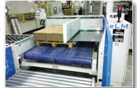
Lift equipped with plastic belt For stable transport.