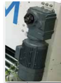
All electric And therefore smooth movements.