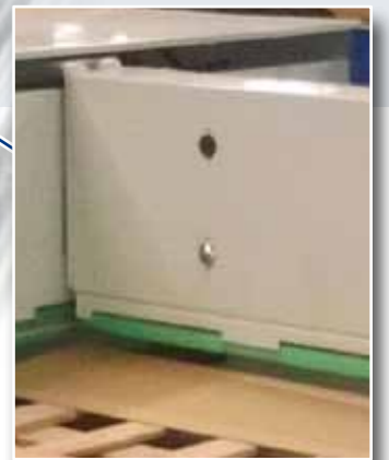
Auto stripper cycle ball For 1 and 2 up orders.