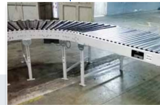
Bundle conveyors option To feed bundles to eLM.