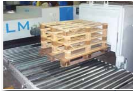
PalletHandler option To deliver pallets to the eLM.