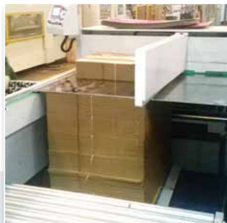
Load compression To generate a more stable stack.