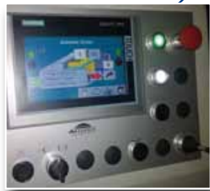
Main control panel With an integrated user-friendly touch screen.