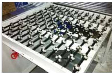
Ball table option (Stainless steel table is standard).