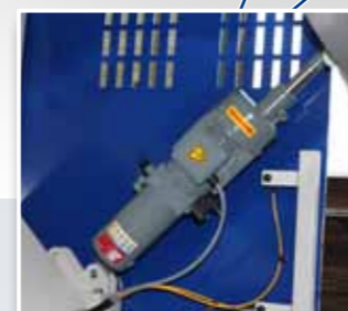
Lifting units For safe, strong and controlled lifting of the extendo.