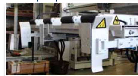
Tampers option Powered adjustable side tamper guide. Operating and drive side.